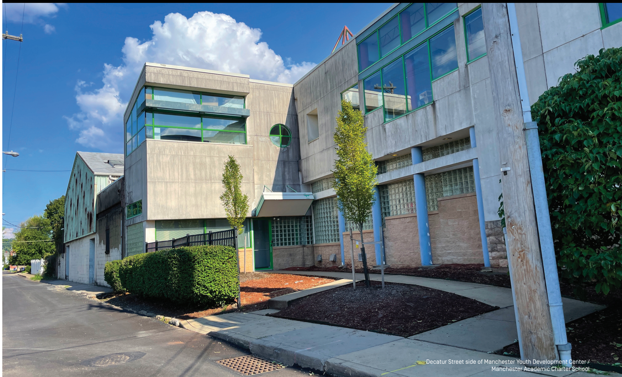
Decatur Street side of Manchester Youth Development Center / Manchester Academic Charter School

PITTSBURGH MODERN COMMITTEE OF PRESERVATION PITTSBURGH