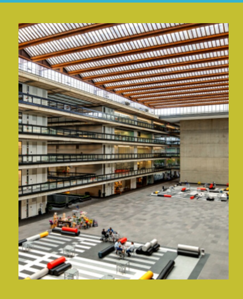
Interior at BellWorks, Holmdel, New Jersey